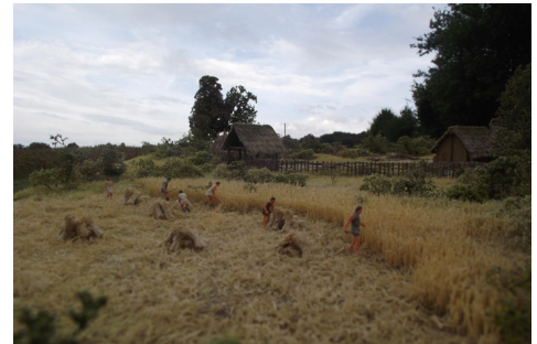
Scale model 1/100 (1mx1m), located at the Archaeological Museum of Douai (59)